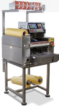
Shown with optional stand and POP label dispenser (121076, 125578)