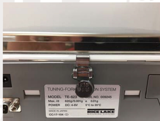
Sealing TE 1501NC thru TE 15001