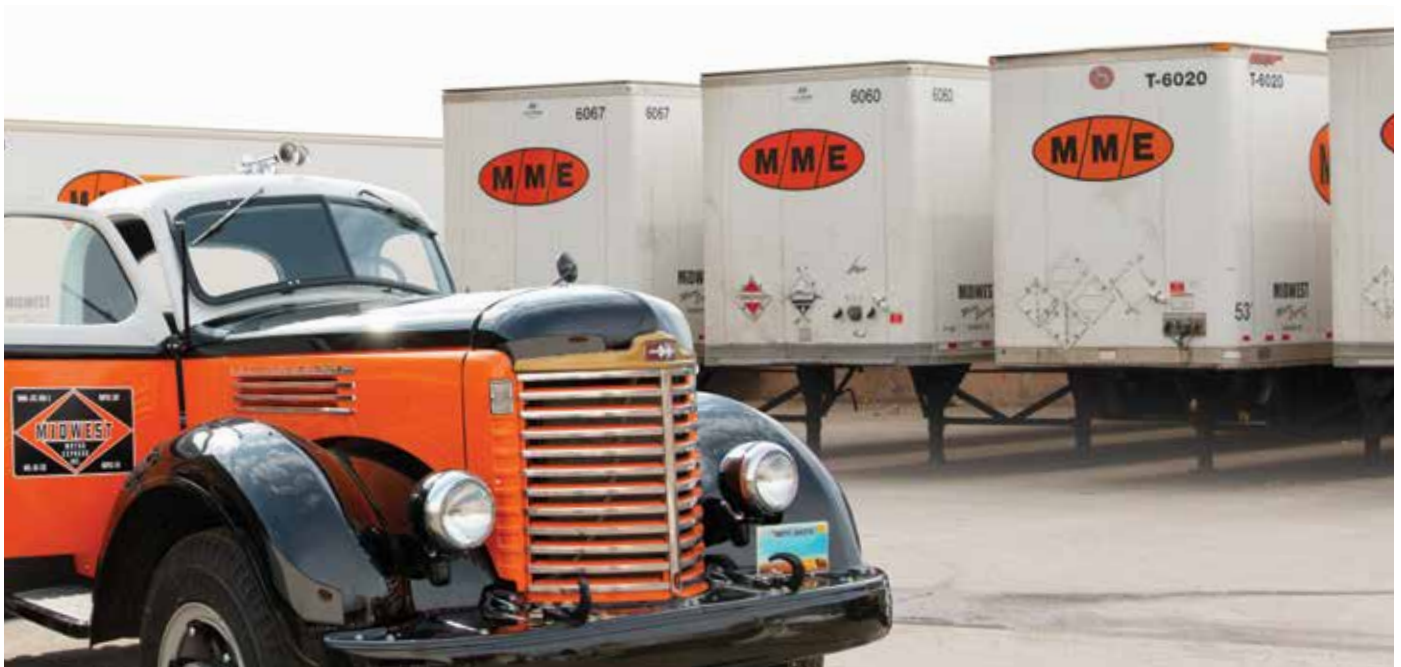
Midwest Motor Express increased shipping process efficiency by utilizing Rice Lake forklift scales, instrumentation and dimensioners.

Midwest Motor Express is home to many claims of fame, including their experienced drivers, impeccable safety record and one of the lowest claim ratios in the business. The company continues to grow, and with weighing and dimensioning systems integrated into their proven business model, a future of continued superior transportation services as an industry leader is en route for Midwest Motor Express. ■