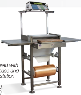
Uni-3 L2i pictured with remote scale base and optional wrap station components. (47672, 47670, 53963, 46927)