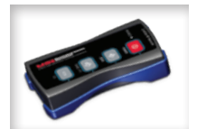
Rugged Remote Controller