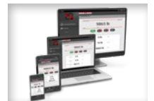
MSI ScaleCore Webservice