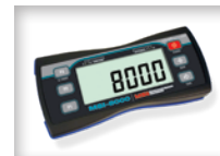
MSI-8000 RF Remote Display