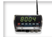
MSI-8004HD Remote Display