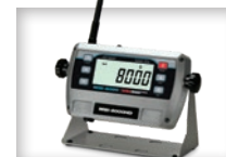
MSI-8000HD RF Remote Display