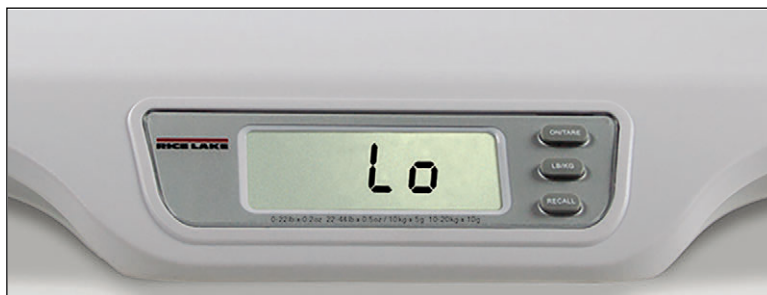
Figure 2-2. Low Battery Indicator

The VS-11 can also be powered by four AA alkaline batteries if an additional power source is not available. A battery powered scale automatically turns off after two minutes of not being used to save battery life. Replace the batteries or connect to an AC power source as soon as possible if the low battery indicator ( Lo ) displays.