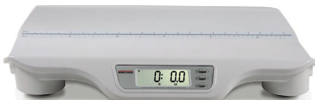
Figure 1-1. VS-11 Dual-Range Veterinary Scale

Warranty information is available at www.ricelake.com/warranties