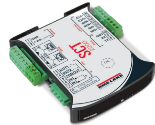
Optional SCT-2200 transmitter

Cable Length: 20 ft integral cable with blunt end termination