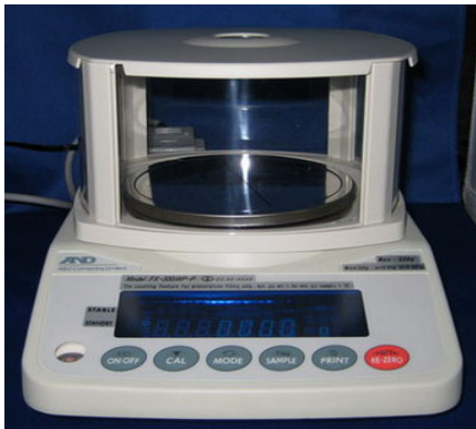
Model FX-300iN – Front View