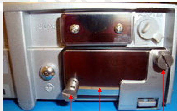
Model FX 3000iWP-P – Calibration Plate and Screws View