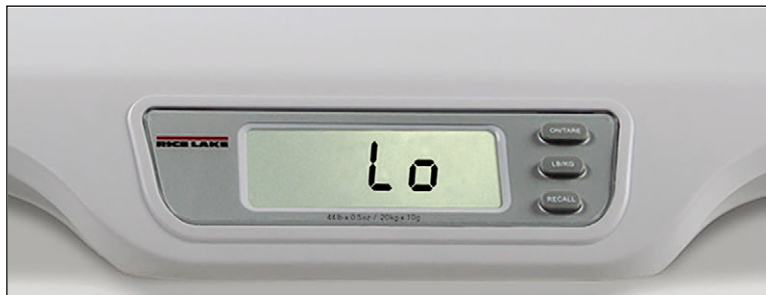
Figure 2-2. Low Battery Indicator

The VS-10 can also be powered by four AA alkaline batteries if an additional power source is not available. A battery powered scale automatically turns off after two minutes of not being used to save battery life. Replace the batteries or connect to an AC power source as soon as possible if the low battery indicator ( Lo ) displays.