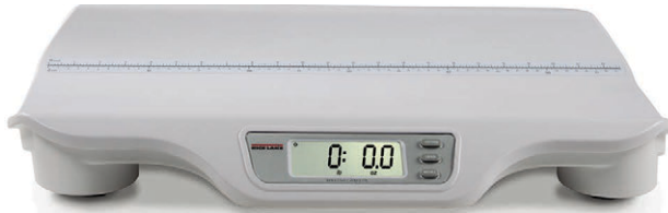
Figure 1-1. VS-10 Veterinary Scale

Warranty information is available at www.ricelake.com/warranties