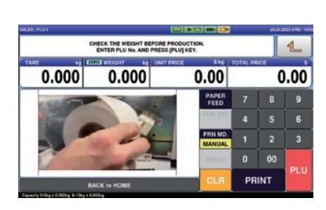
Label Replacement Training