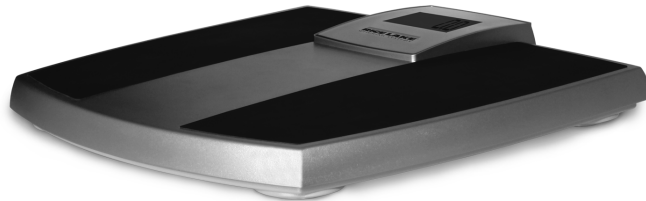
Figure 1. Digital Health Scale

This manual can be viewed and downloaded from the Rice Lake Weighing Systems web site at www.ricelake.com/health . Rice Lake Weighing Systems is an ISO 9001 registered company.