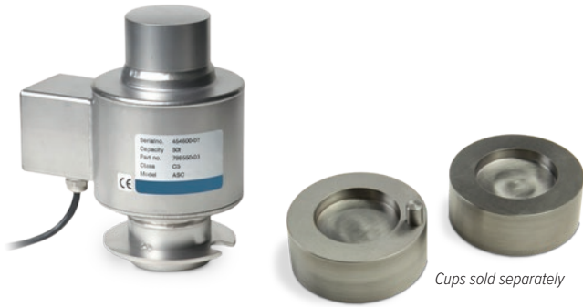
Picture is a representation of actual product