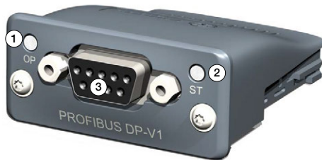
Figure 2-5. Profibus DP Status LED Module