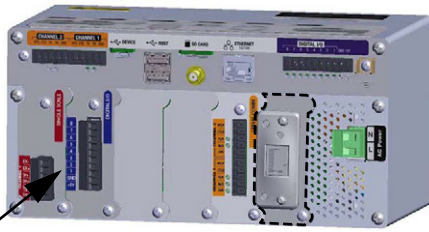
Installed Option Card