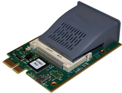
Carrier Board with Module