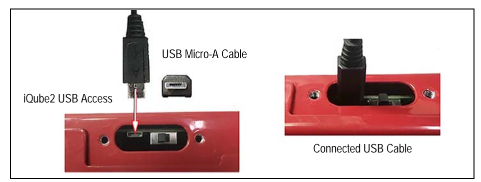
Figure 1. Firmware Update Cable Connection

During annual calibrations and repairs, update the CLS-M Series iQube2 forklift junction box using the latest version of Revolution and a USB A to Micro-A cable (Rice Lake PN 152434).