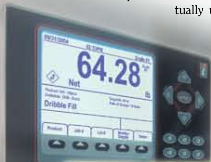
The 920i features a large display screen, configured with icons, prompts, messages, soft keys, and selectable character sizes.

The 920i is Rice Lake's signature HMI digital weight indicator controller and is incorporated into all Series 10 filling stations. Its robust processing power provides ultimate control for fast, accurate filling. Designed for ease-of-use, the 920i combines performance-driven circuitry and intuitive features to give you virtually unlimited power while maintaining user-friendly operation. With up to 14MB of optional memory, the 920i gives you the power to manage critical upstream and downstream information specific to your filling needs.