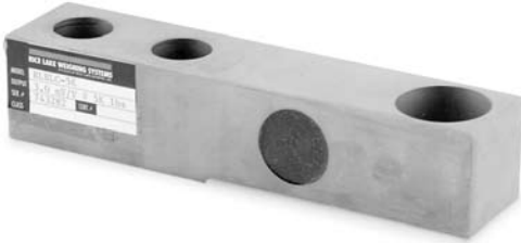
Picture is a representation of actual product