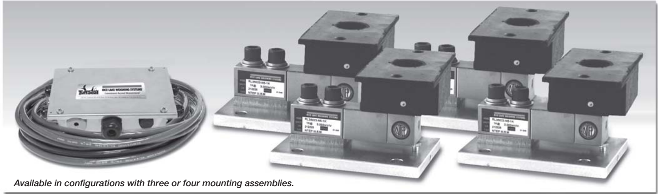
Available in configurations with three or four mounting assemblies.

Picture is a representation of actual product