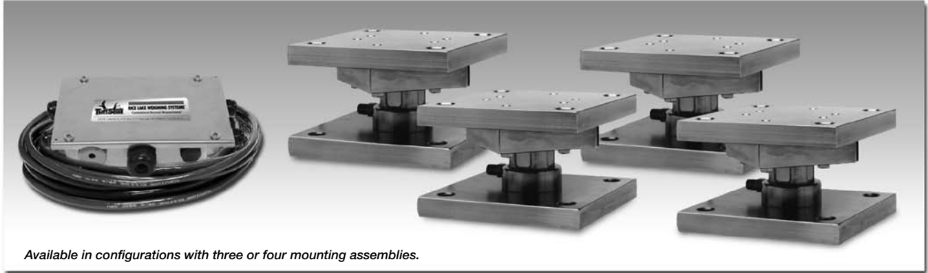
Available in configurations with three or four mounting assemblies.

Picture is a representation of actual product