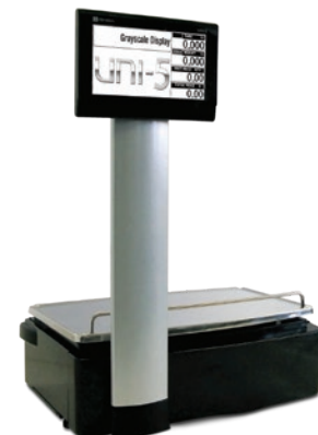
Pole scale customer side