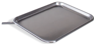
Fish Platter PN 46917

**Manuals and software programs can be downloaded from the distributor section of www.ricelake.com/retail