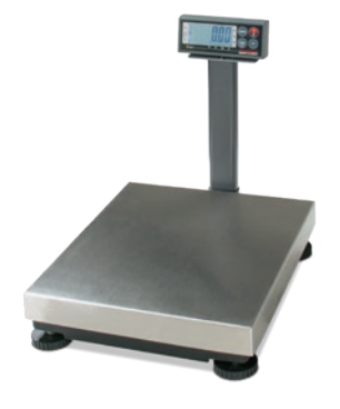
BP-R 12 × 14 scale with optional column bracket & post