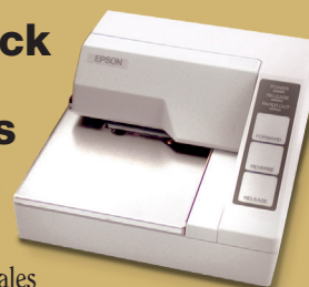
EPSON TM-U295 Ticket Printer

For livestock scales that do not include an onboard ticket printer, Rice Lake offers a full line of printers ideally suited for livestock weighing.