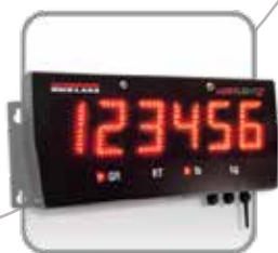
LaserLight2 Remote Display