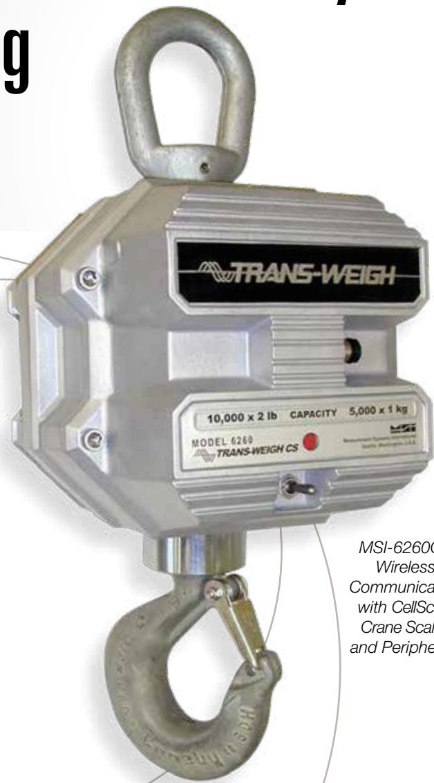
MSI-6260CS Wireless Communication with CellScale Crane Scales and Peripherals