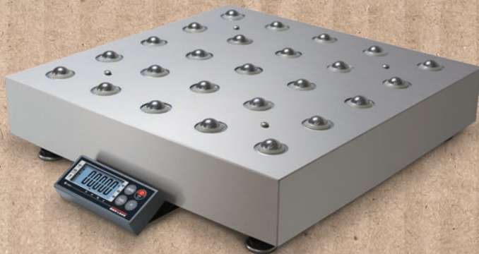
Model BP-SB with ball top shroud

The BP-S can be connected via a USB-HID connection to shipping programs like UPS WorldShip® and FedEx Ship Manager®. Other third-party software can access weight data through the RS-232 port.