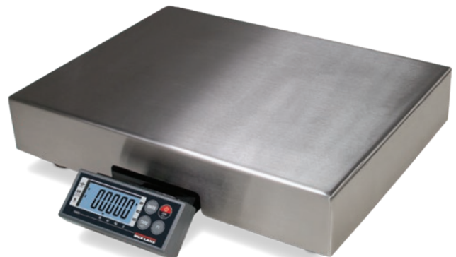
Model BP-S (18 × 18 or larger)

The BP-S can be equipped with an additional post mount or tabletop display, allowing multiple people to view weight at the same time. A scratch-resistant, tempered glass display will withstand the impact of accidentally dropped packages. This makes it ideal for a fast-paced environment where time is money.