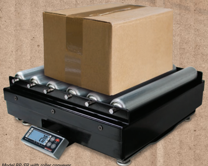
Model BP-SR with roller conveyor