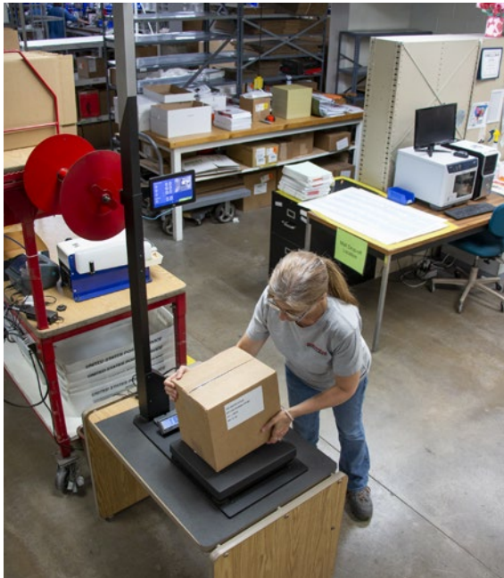
BenchPro BP-S paired with the iDimension Plus

Pair the BenchPro BP-S with painted steel cover with Rice Lake's iDimension® dimensioner to capture accurate cubic dimensions of freight. Dimensioners ensure freight code compliance while deterring revenue loss that can result from miscalculated dimensions. The BenchPro BP-S with painted steel cover is specifically designed to complement the iDimension dimensioner, creating a holistic shipping and logistics operation.