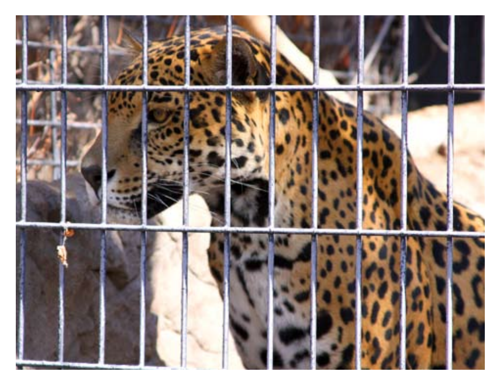
A special apparatus was created to publicly weigh the lions which utilizes Rice Lake's IQ plus® 355 digital weight indicator and a RoughDeck floor scale.

Our Day at the Zoo · Continued from page 14