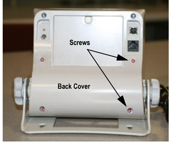
Figure 1. Back Cover Screw Locations

1. Remove the four screws securing the back cover to the indicator (see Figure 1).