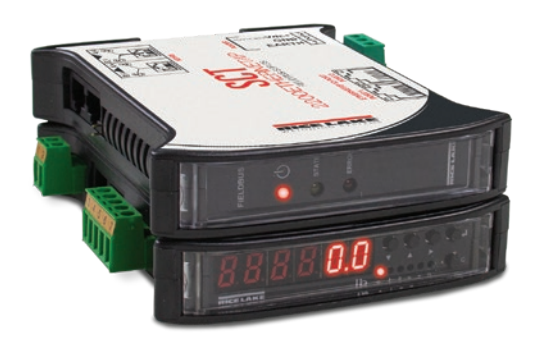
SCT-2200 Advanced Series Signal Conditioning Weight Transmitter