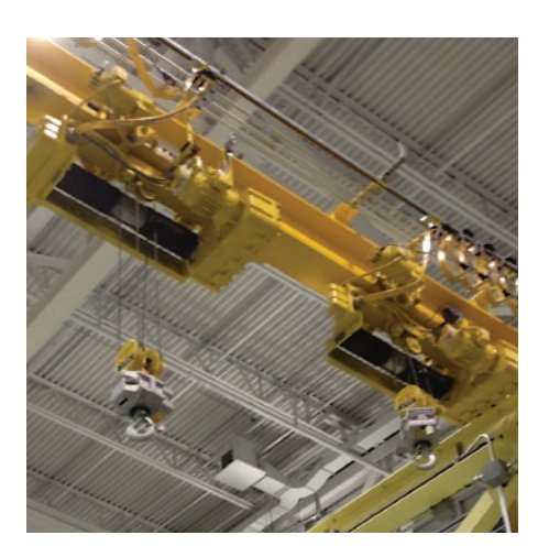
Bridge cranes pair well with a variety of MSI scales, though environment can impact the choice.