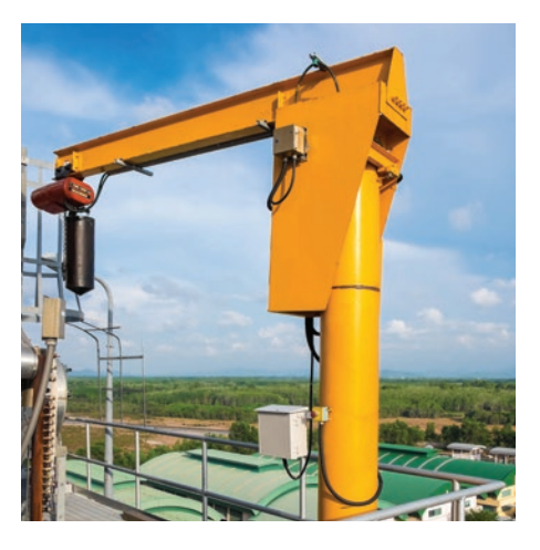
We recommend the MSI-3460 for jib cranes

Contact your MSI sales/solution specialist for assistance in selecting the right solution for you.