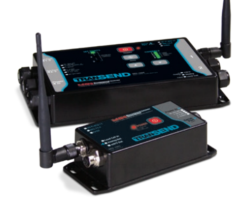
TranSend Wireless Load Cell Interface

The MSI ScaleCore Webserver is a network interface with a built-in web browser for remote monitoring of a scale system. Communicate with any combination of up to seven devices and any MSI ScaleCore based scale or weighing instrument equipped with a Wi-Fi module.