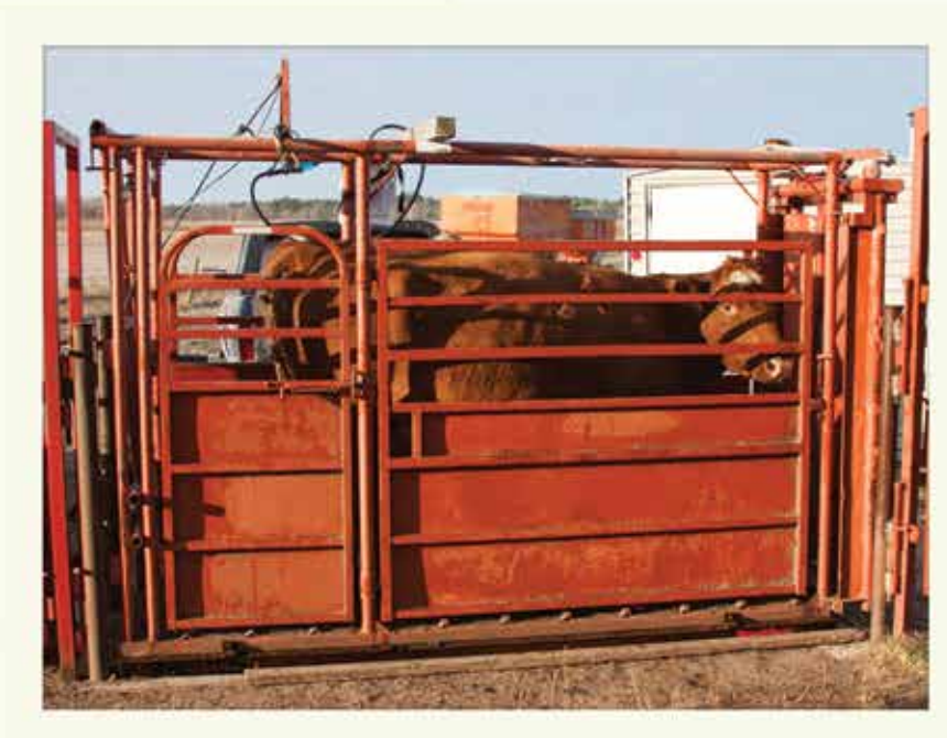
Rice Lake's RoughDeck SLV livestock scale has helped the Schmidt family track animal weight and rate of gain—two key components to ensure the best profit for their farm.