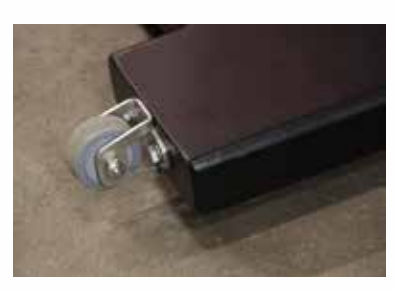
Optional wheel kit