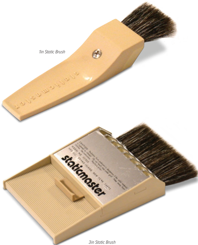
1in Static Brush

NRD alpha-energy ion sources totally eliminate static buildup, not just reduce it, as with other methods of static control. As with all types of ion sources, ionized air has absolutely no adverse effects on personnel.