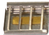
1in x 1in Ionizing Strip