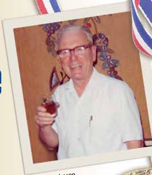
Donald B. Johnson 50 Year Member Award