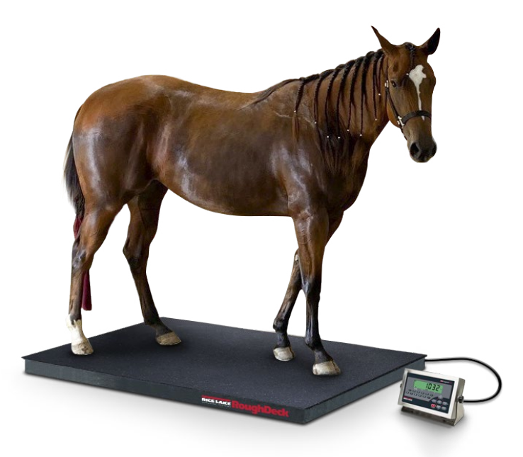
Roughdeck® EQ with 482 Indicator

Rice Lake Weighing Systems' RoughDeck® EQ equine scales are designed specifically for the safe and reliable weighing of horses of all breeds and sizes. The heavy-duty removable mat provides extra cushion comfort and is noise-reducing, creating a calm weighing environment.