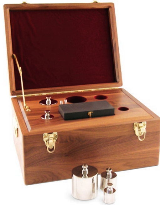
Set Includes Lifting Device, Glove and Case (3kg to 1g)