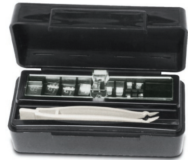
Set Includes Tweezer and Glove