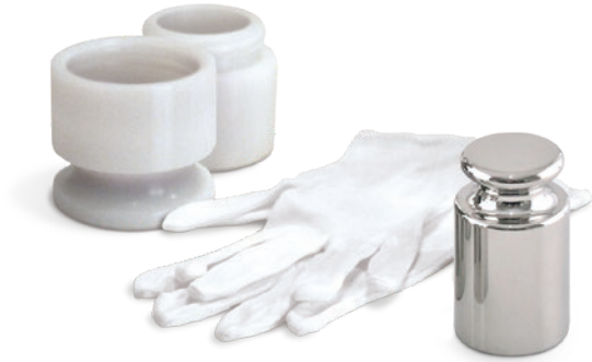
Kits Include a Single Weight with Case and Glove