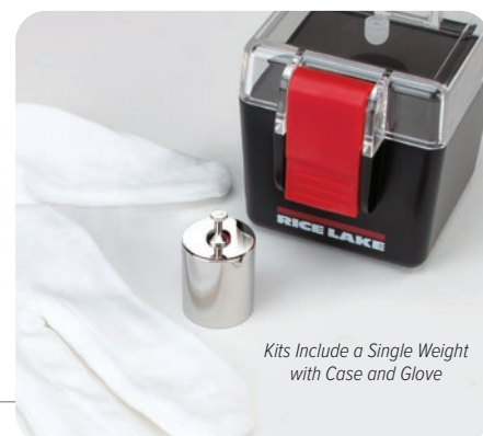
Kits Include a Single Weight with Case and Glove

ASTM PRECISION OIML PRECISION BALANCE CALIBRATION STAINLESS FIELD WEIGHTS CAST IRON FIELD WEIGHTS SPECIALTY ACCESSORIES