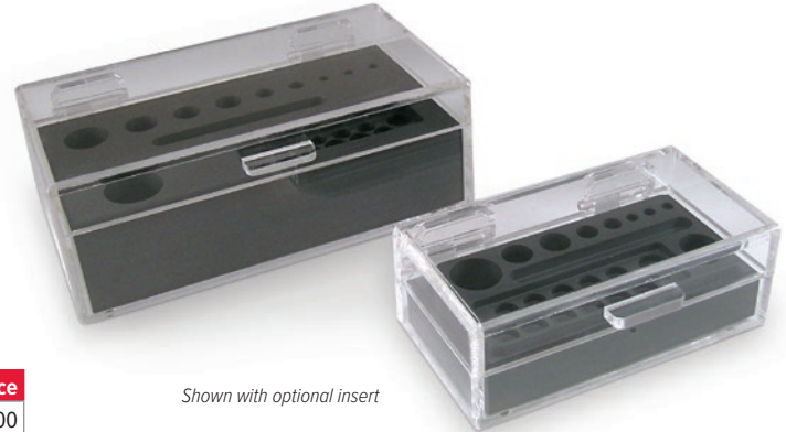
Shown with optional insert