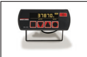
OB-350 Indicator, PN 131219