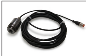
Hydraulic Transducer, PN 131211