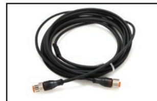
Homerun Cable, PN 131228

Compatibility note: The Loadrunner dump truck kit has been designed for use on dual pin hinge pivot type dump bodies only. For dump truck body rear pivot assemblies using a single hinge bar, contact Rice Lake.