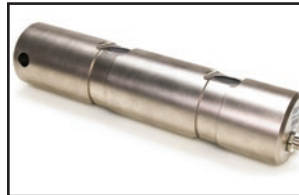
Dump Truck Load Pin, PN 181895