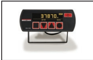
OB-350 Indicator, PN 131219