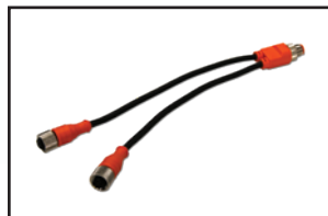
Y-Splitter Cable, PN 131226