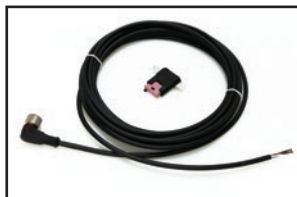
Power Cable, PN 131221