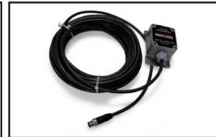
Onboard Inclinometer, PN 131222