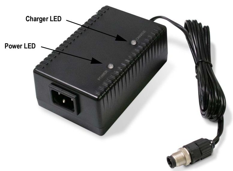
Figure 1. IS6V2 Battery Charger

IMPORTANT: Connections to the battery pack must be made in the non-hazardous area before connecting the cable to the 882IS indicator.