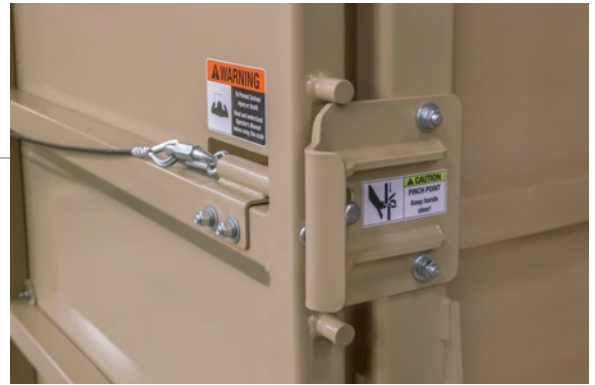
Heavy-duty latch assembly

The MAS-LC offers unmatched traction for animals in wet and slippery conditions with either X-Lug flooring with a deep, aggressive tread or X-Plank flooring with a less-aggressive, wheel-accessible tread. Both styles are made from durable, recycled plastic and rubber material that will never rot or harbor bacteria and moisture like wood flooring.