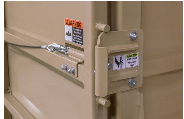
Heavy-duty latch assembly

The MAS-LC offers unmatched traction for animals in wet and slippery conditions with either X-Lug flooring with a deep, aggressive tread or X-Plank flooring with a less-aggressive, wheel-accessible tread. Both styles are made from durable, recycled plastic and rubber material that will never rot or harbor bacteria and moisture like wood flooring.