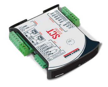
Optional SCT-2200 transmitter

20 ft integral cable with blunt end termination