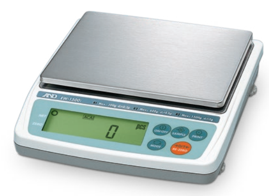
EW-1500i square pan