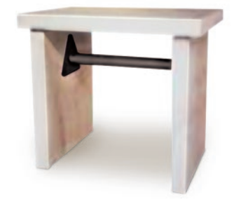
Provides the most stable surface possible for precision. instruments. Legs are reinforced with support pipe.