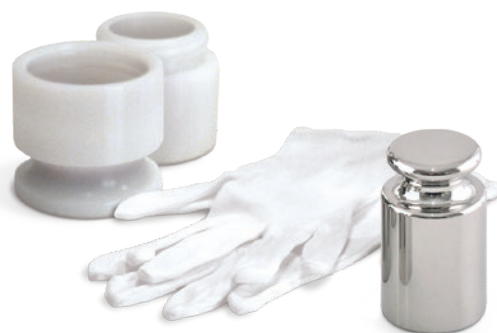
Kits Include a Single Weight with Case and Glove