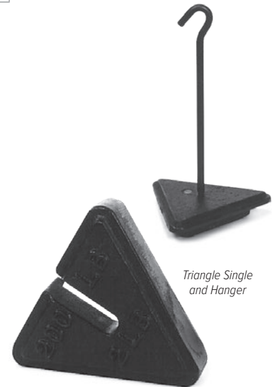
Triangle Single and Hanger