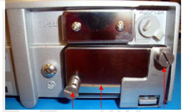
Model FX 3000iWP-P - Calibration Plate and Screws View