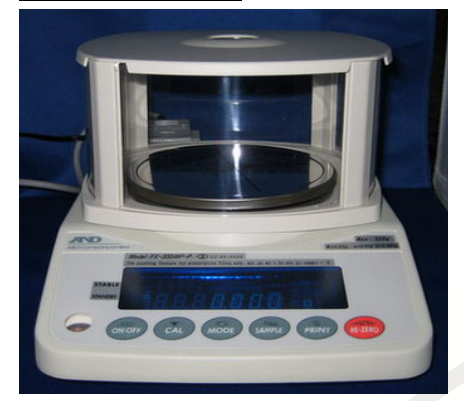
Model FX-300iN - Front View