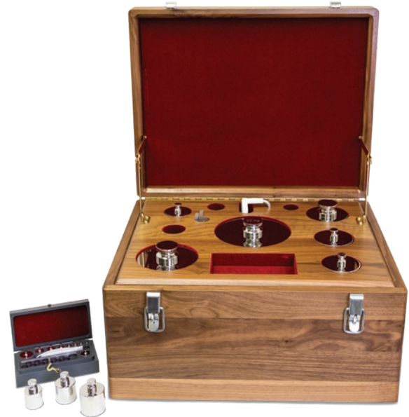
Set Includes Lifting Device, Glove and Case (20 kg to 1 mg)