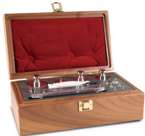
Set Includes Lifting Device, Glove and Case (500 g to 1g)