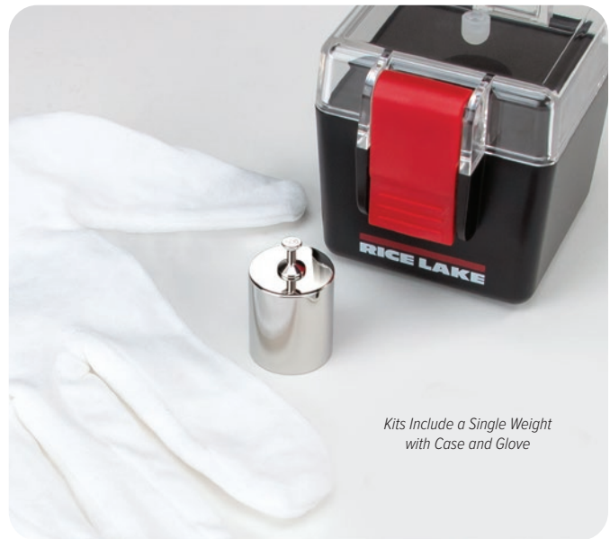
Kits include a Single Weight with Case and Glove