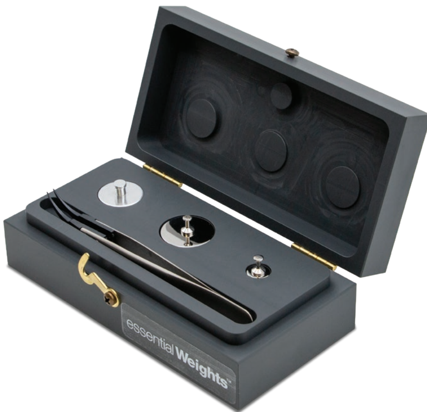
200 g PVC Set Shown, Other Sets Will Vary