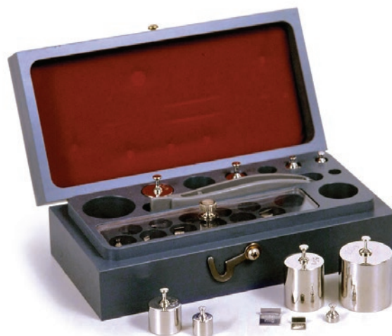
Set Includes Lifting Device, Glove and Case