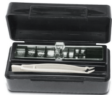
Set Includes Tweezer and Glove