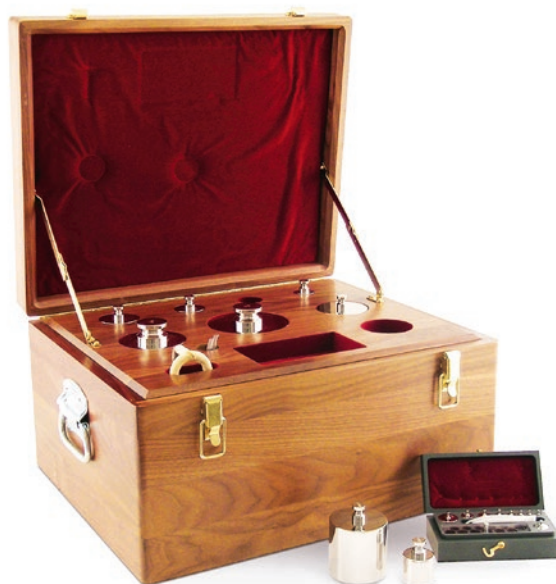
Set Includes Lifting Device, Glove and Case (10 kg to 1 mg)