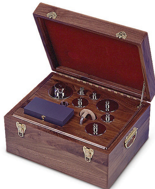
Set Includes Lifting Device, Glove and Case (10 lb to 1/32 oz)