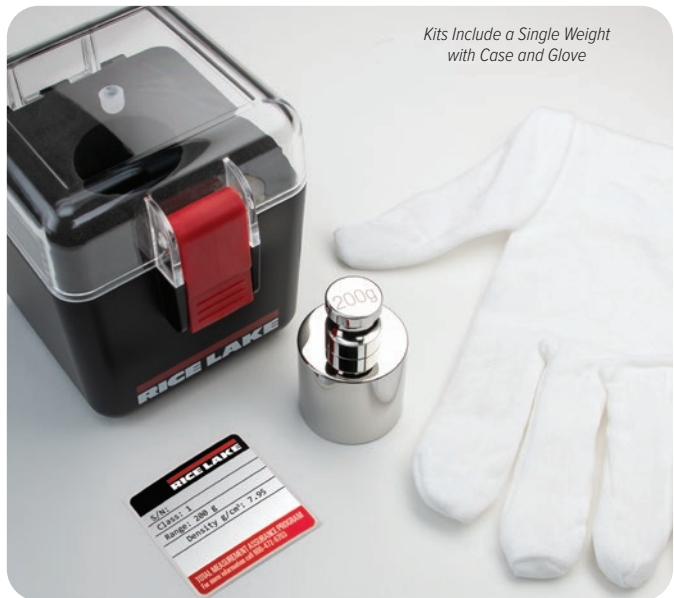
Kits Include a Single Weight with Case and Glove