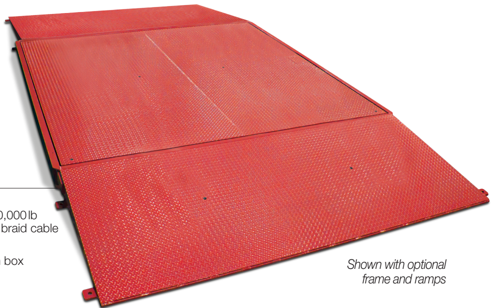
Shown with optional frame and ramps

Your Rice Lake Weighing Systems distributor is: