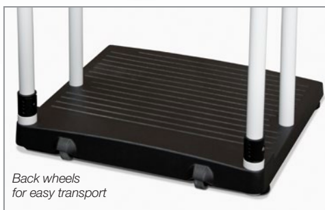
Back wheels for easy transport