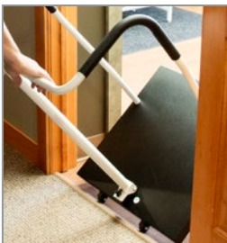
Back wheels for easy transport