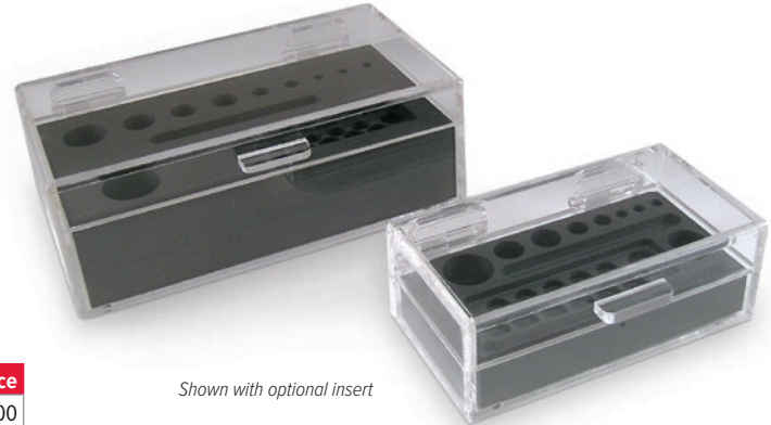
Shown with optional insert