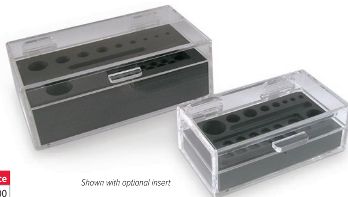
Shown with optional insert