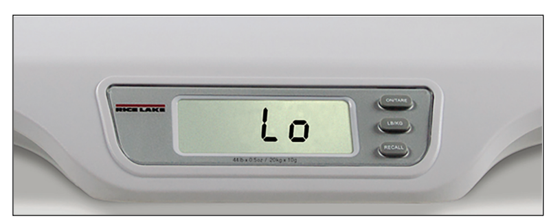
Figure 2-2. Low Battery Indicator

The RL-DBS can also be powered by four AA alkaline batteries if an additional power source is not available. A battery powered scale automatically turns off after two minutes of not being used to save battery life. Replace the batteries or connect to an AC power source as soon as possible if the low battery indicator ( Lo ) displays.