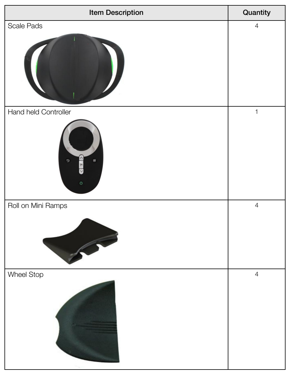
Table 3-1. D1100 Component Parts

Visually inspect the D1100 Series scale to ensure all components are included and undamaged. Standard hardware includes: