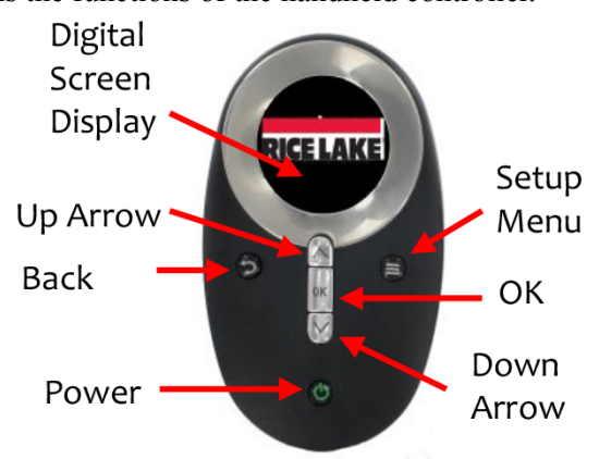
Figure 3-1. Handheld Controller Key Functions

The following section explains the functions of the handheld controller.