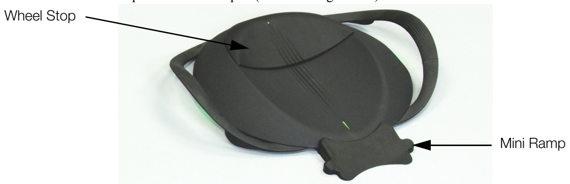
Figure 4-1. Wheel Stop and Mini Ramp Attached to Scale Pad

4. Seek assistance to help roll the bed onto the scale pads. For best results keep the wheels as close to the center of the pads as possible.